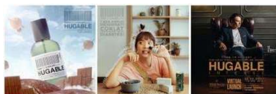
Fig. 5. Tiden's Content

Tiden also utilizes Instagram and TikTok as platforms to promote its products. On Instagram feeds, Tiden uploads static content that often includes written information to convey details. These posts also feature images of the perfumes they sell, often accompanied by models to illustrate potential users of the perfumes. In the short video format uploaded on Instagram reels, Tiden utilizes the "Don't Show on Feeds" feature, meaning that the short video uploaded won't be visible on their main Instagram page but only on the Instagram reels section. By using this feature, it helps keep the main page more organized.