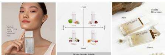
Fig. 2. Company's Content

On Instagram, De'Xandra makes use of two widely used features: Instagram posts and Instagram reels. Static content, in the form of non-moving images or graphics, is uploaded to Instagram posts. The majority of De'Xandra's static content consists of product photos adorned with various ornaments like wood, flowers, and leaves. However, less than 20% of the content includes interactive elements such as tips and tricks, facts or myths, and trivia quizzes. Some of these contents are created to foster interaction between De'Xandra and its consumers.