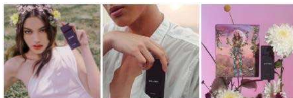
Fig. 4. Saff & Co's Content

Co uploads product photos along with a model. The model featured alongside the perfume represents the fragrance and the user of the perfume. The Ostara fragrance is characterized as feminine with a dominant floral scent. Short video content uploaded on Instagram Reels provides behind-the-scenes glimpses of Saff & Co's content creation process. This is aimed at bringing the audience closer to the brand by showing transparency.