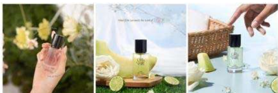
Fig. 3. Carl n Claire's Content

In promoting their products, Carl n Claire utilizes Instagram posts and Instagram Reels as platforms. On Instagram posts, Carl n Claire uploads static content consisting of product photos decorated to match the offered fragrance. Additionally, Carl n Claire also makes use of Instagram Reels, which are short video clips that provide product information. Some of these short videos discuss the various products offered, where to find them, and showcase the perfume bottles and packaging.